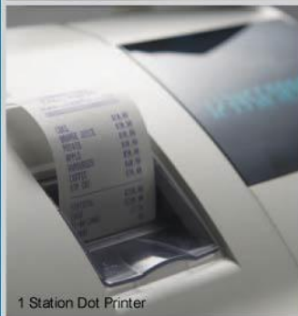
1 Station Dot Printer