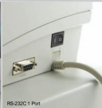
RS-232C 1 Port