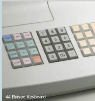
44 Raised Keyboard