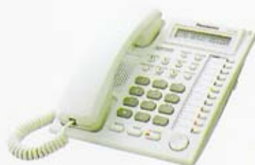
■ KX-T7730 LCD, Speakerphone Unit

* An optional card is required. Please contact your dealer or phone company to confirm if the Caller ID service is available in your area.