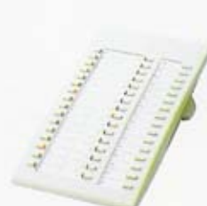
■ KX-T7740 DSS Console