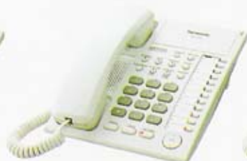
■ KX-T7720 Speakerphone Unit