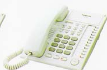
■ KX-T7750 Monitor Unit